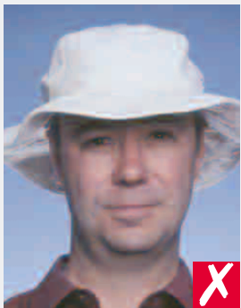
wearing a hat