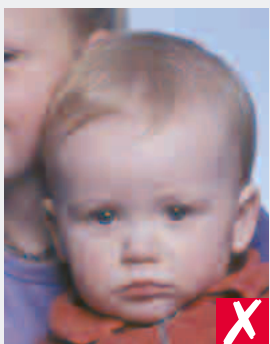
shows another person