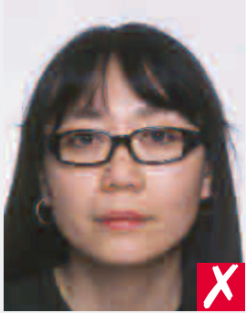
frames too heavy