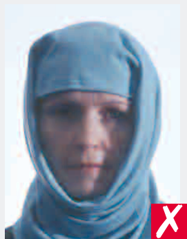
shadows across face