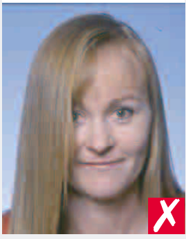
hair across eyes