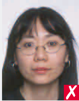
frames covering eyes