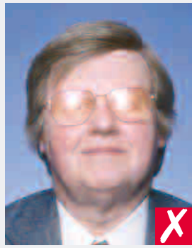
flash reflection on lenses