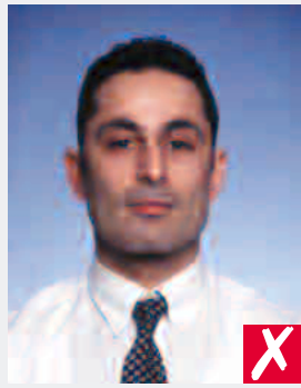
too far away