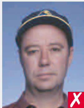
wearing a cap