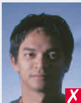
shadows across face