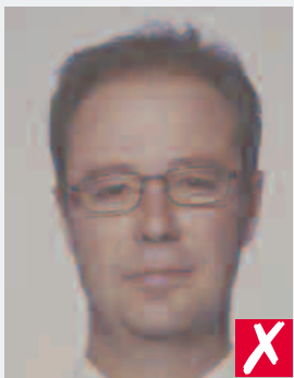
washed out colour