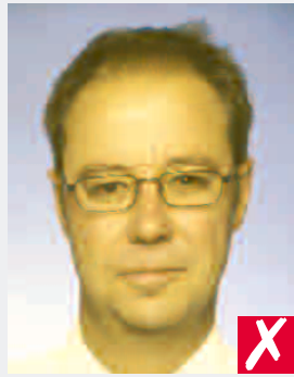
unnatural skin tones