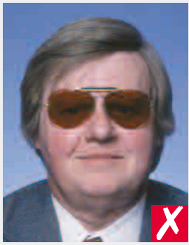
dark tinted lenses