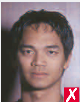
shadows behind head